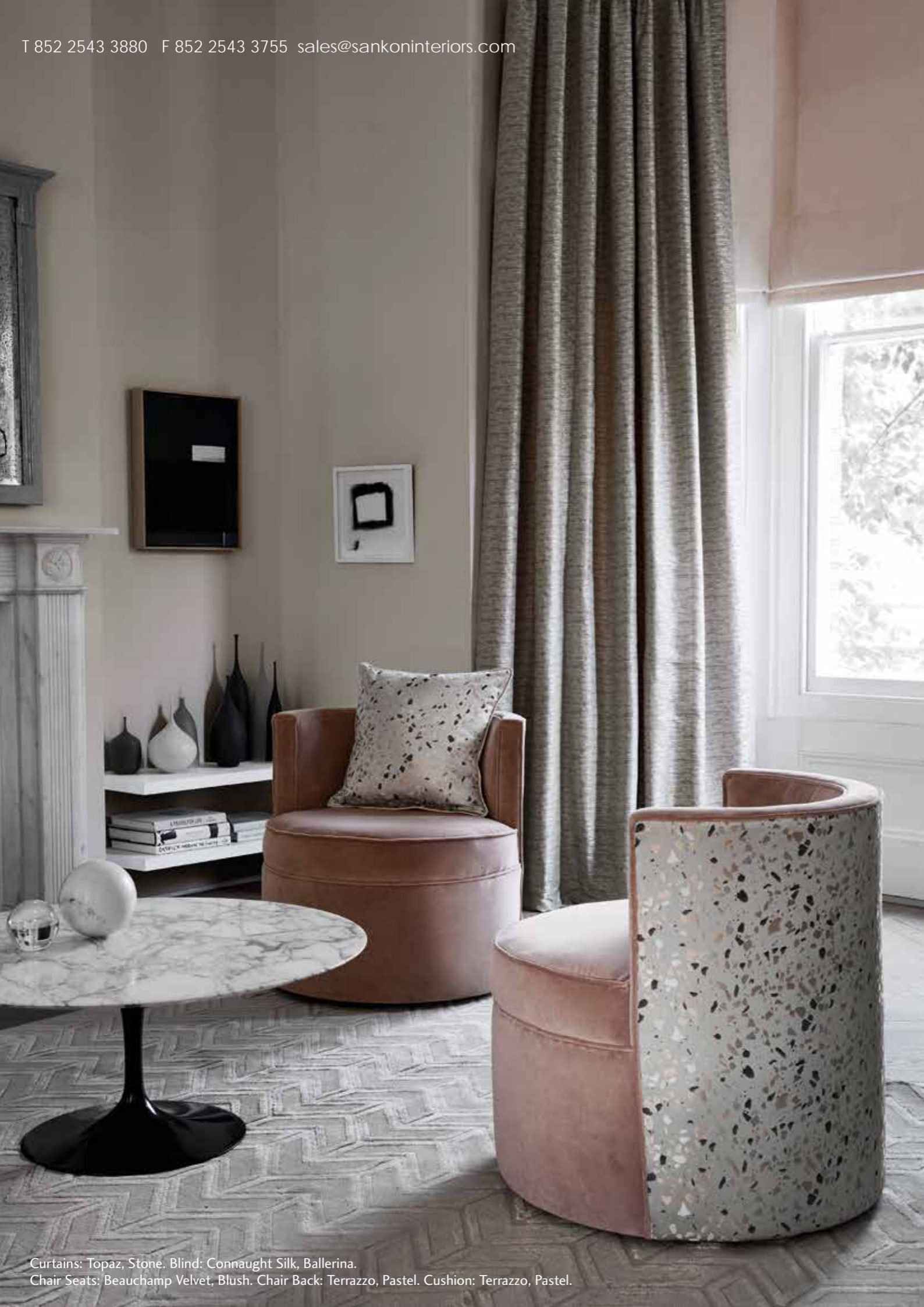
Curtains: Topaz, Stone. Blind: Connaught Silk, Ballerina. Chair Seats: Beauchamp Velvet, Blush. Chair Back: Terrazzo, Pastel. Cushion: Terrazzo, Pastel.