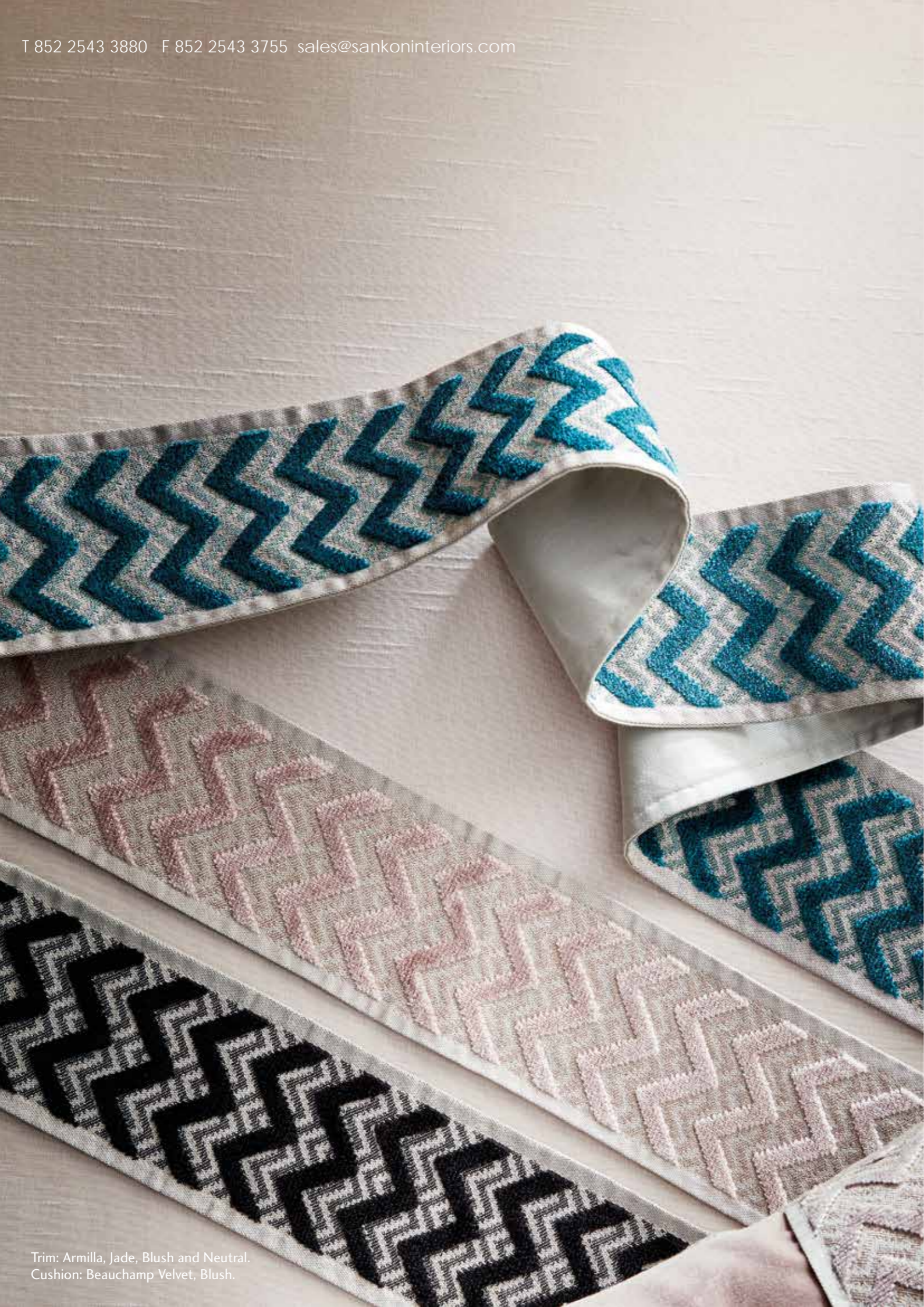
Trim: Armilla, Jade, Blush and Neutral. Cushion: Beauchamp Velvet, Blush.