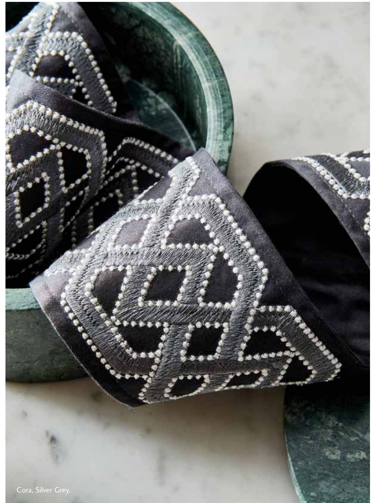
Cora, Silver Grey.