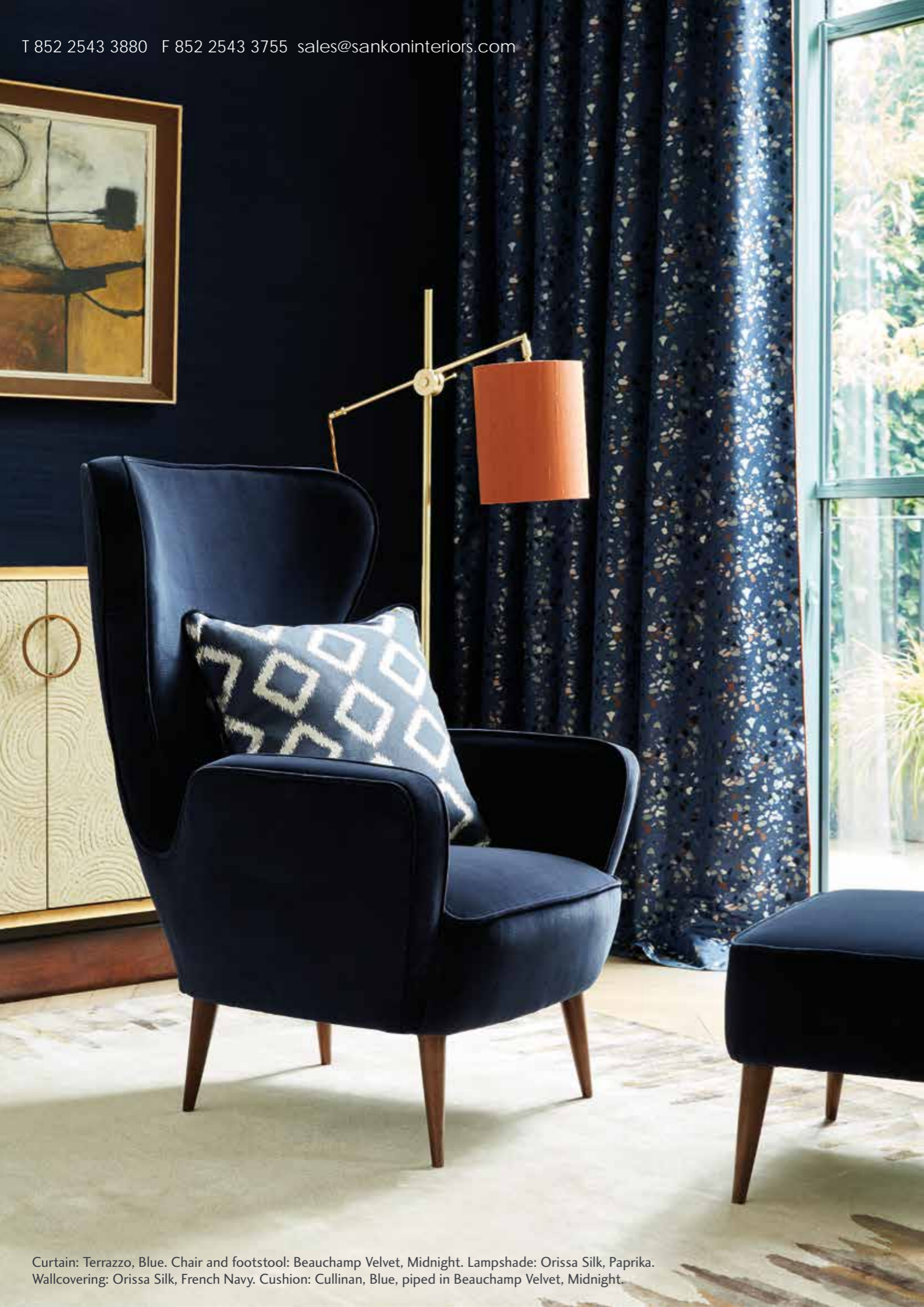
Curtain: Terrazzo, Blue. Chair and footstool: Beauchamp Velvet, Midnight. Lampshade: Orissa Silk, Paprika. Wallcovering: Orissa Silk, French Navy. Cushion: Cullinan, Blue, piped in Beauchamp Velvet, Midnight.