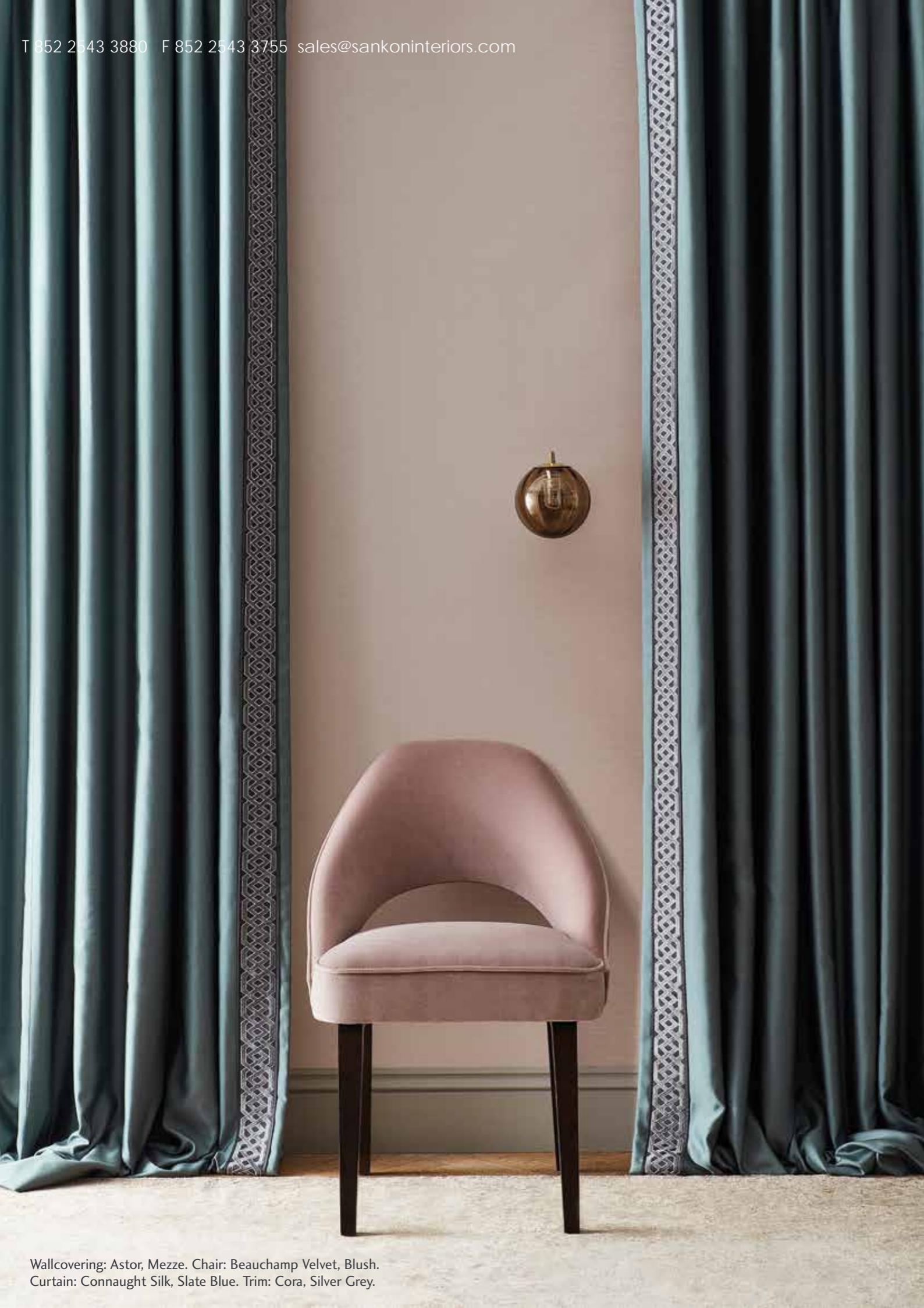
Wallcovering: Astor, Mezze. Chair: Beauchamp Velvet, Blush. Curtain: Connaught Silk, Slate Blue. Trim: Cora, Silver Grey.