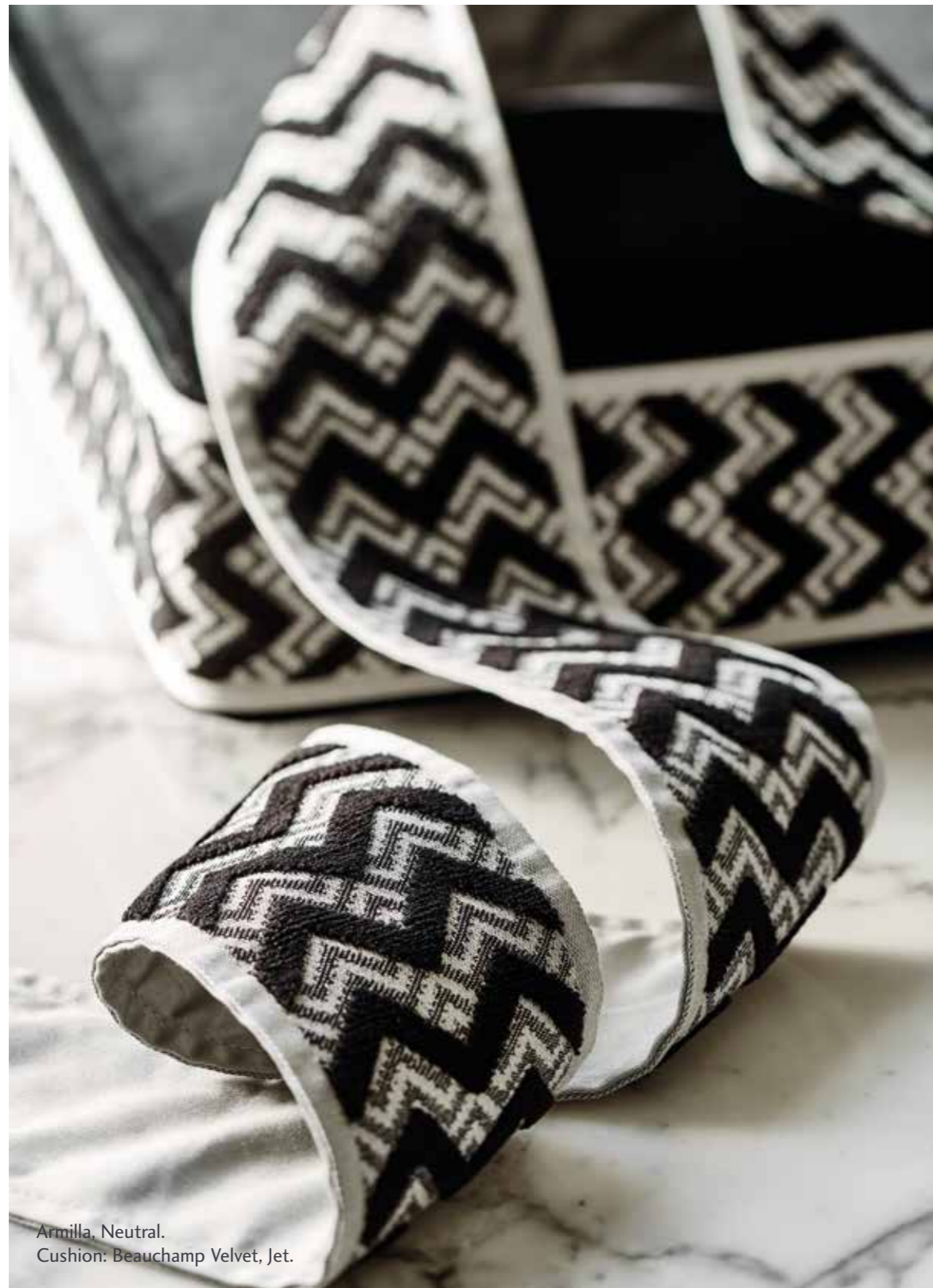
Armilla, Neutral. Cushion: Beauchamp Velvet, Jet.