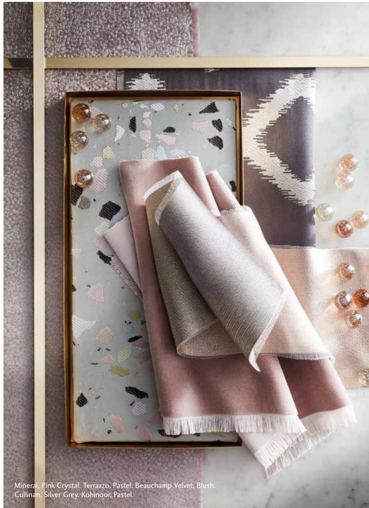
Mineral, Pink Crystal, Terrazzo, Pastel, Beauchamp Velvet, Blush, Cullinan, Silver Grey, Kohinoor, Pastel.