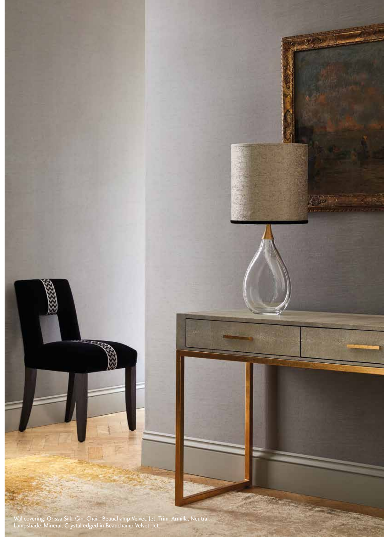
Wallcovering: Orissa Silk, Gin. Chair: Beauchamp Velvet, Jet. Trim: Armilla, Neutral. Lampshade: Mineral, Crystal edged in Beauchamp Velvet, Jet.