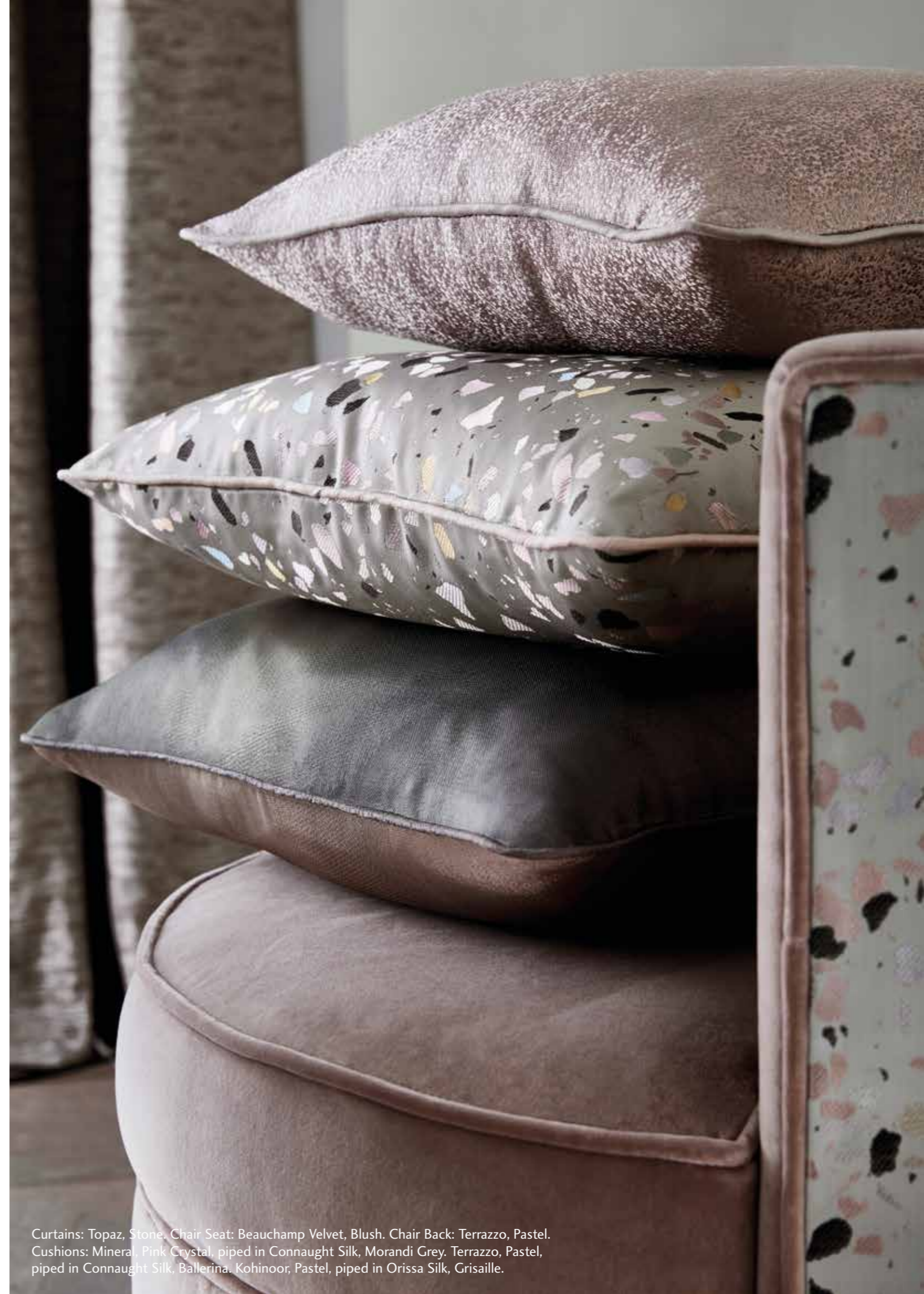
Curtains: Topaz, Stone. Chair Seat: Beauchamp Velvet, Blush. Chair Back: Terrazzo, Pastel. Cushions: Mineral, Pink Crystal, piped in Connaught Silk, Morandi Grey, Terrazzo, Pastel, piped in Connaught Silk, Ballerina, Kohinoor, Pastel, piped in Orissa Silk, Grisaille.