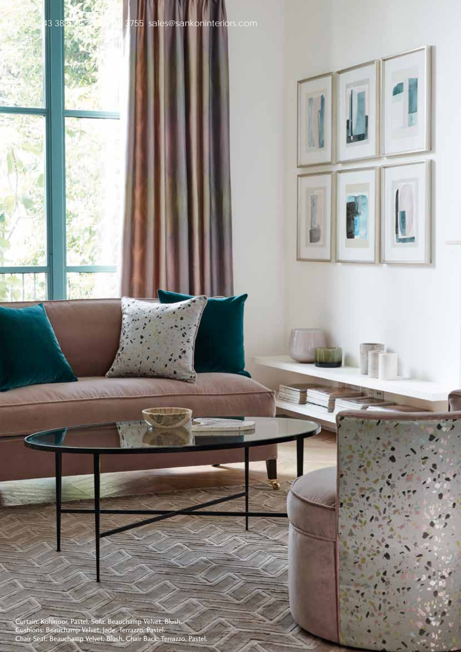
Curtain: Kohinoor, Pastel. Sofa: Beauchamp Velvet, Blush. Cushions: Beauchamp Velvet, Jade, Terrazzo, Pastel. Chair Seat: Beauchamp Velvet, Blush. Chair Back: Terrazzo, Pastel.