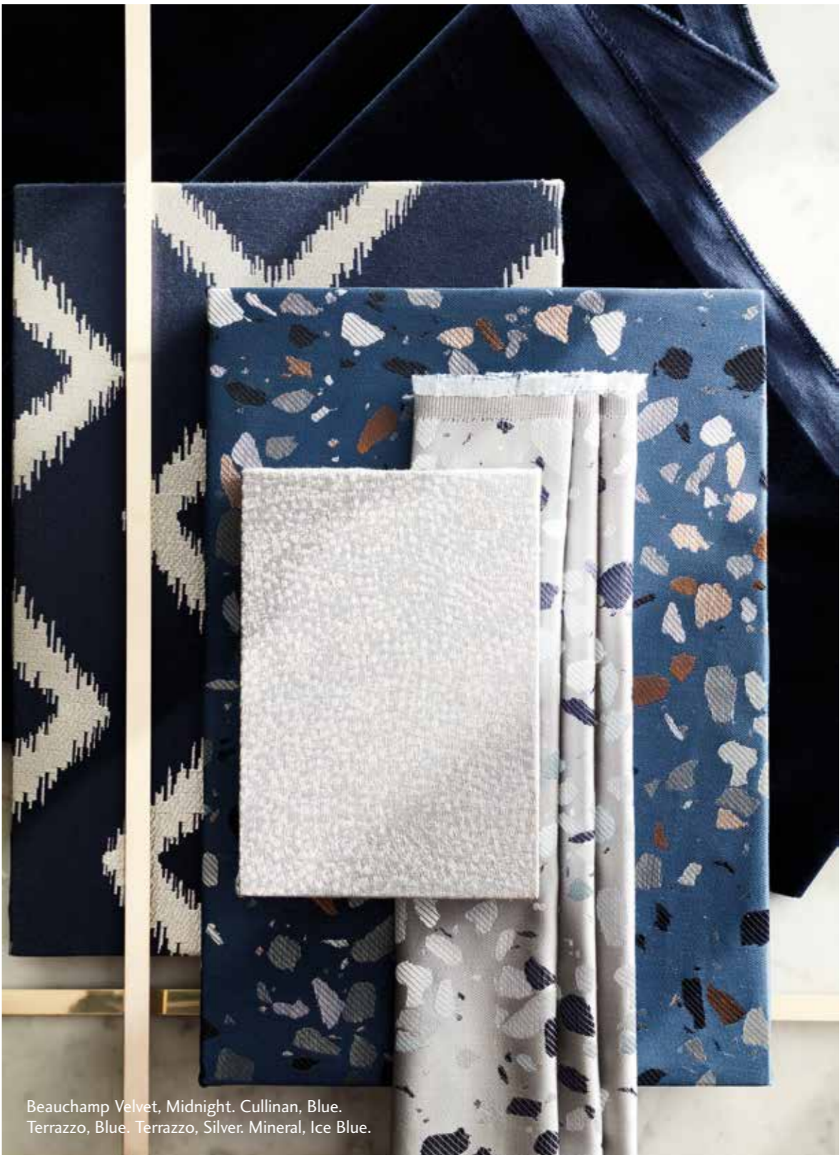
Beauchamp Velvet, Midnight. Cullinan, Blue. Terrazzo, Blue. Terrazzo, Silver. Mineral, Ice Blue.