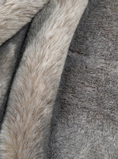
◀ CHINCHILLA FUR / ASH