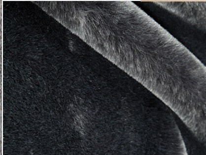
◀ CHINCHILLA FUR / COAL