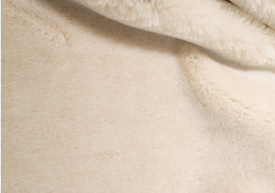
▶ CHINCHILLA FUR / WHITE