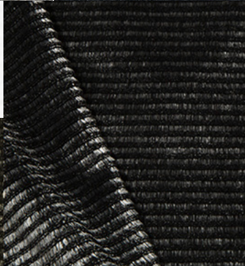
▲ MASSIMO RIB / SILVER