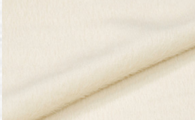
◀ LUXE ALPACA / IVORY