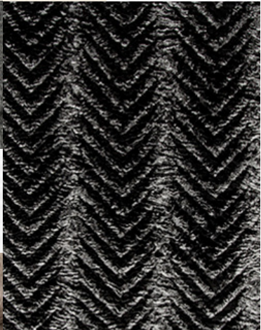
▲ LARIO FUR / BLACK AND WHITE