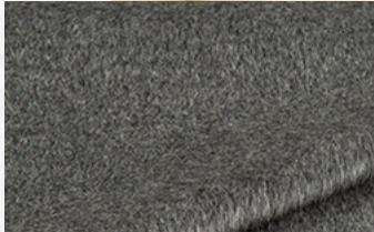
▲ LUXE ALPACA / CHARCOAL LUXE ALPACA / FAWN ▼